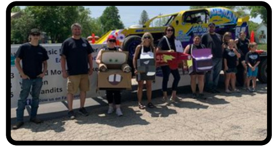
Some 2023 Highlights: City directional signs installed, Senior Center Re-Opening, bike racks installed, Summer Concert Series advertised with partnership of Lot of Deals during the Memorial Day Parade.